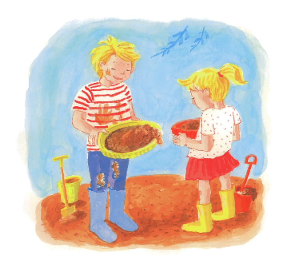
"Look!" said Jenny. "You made a mud pie."