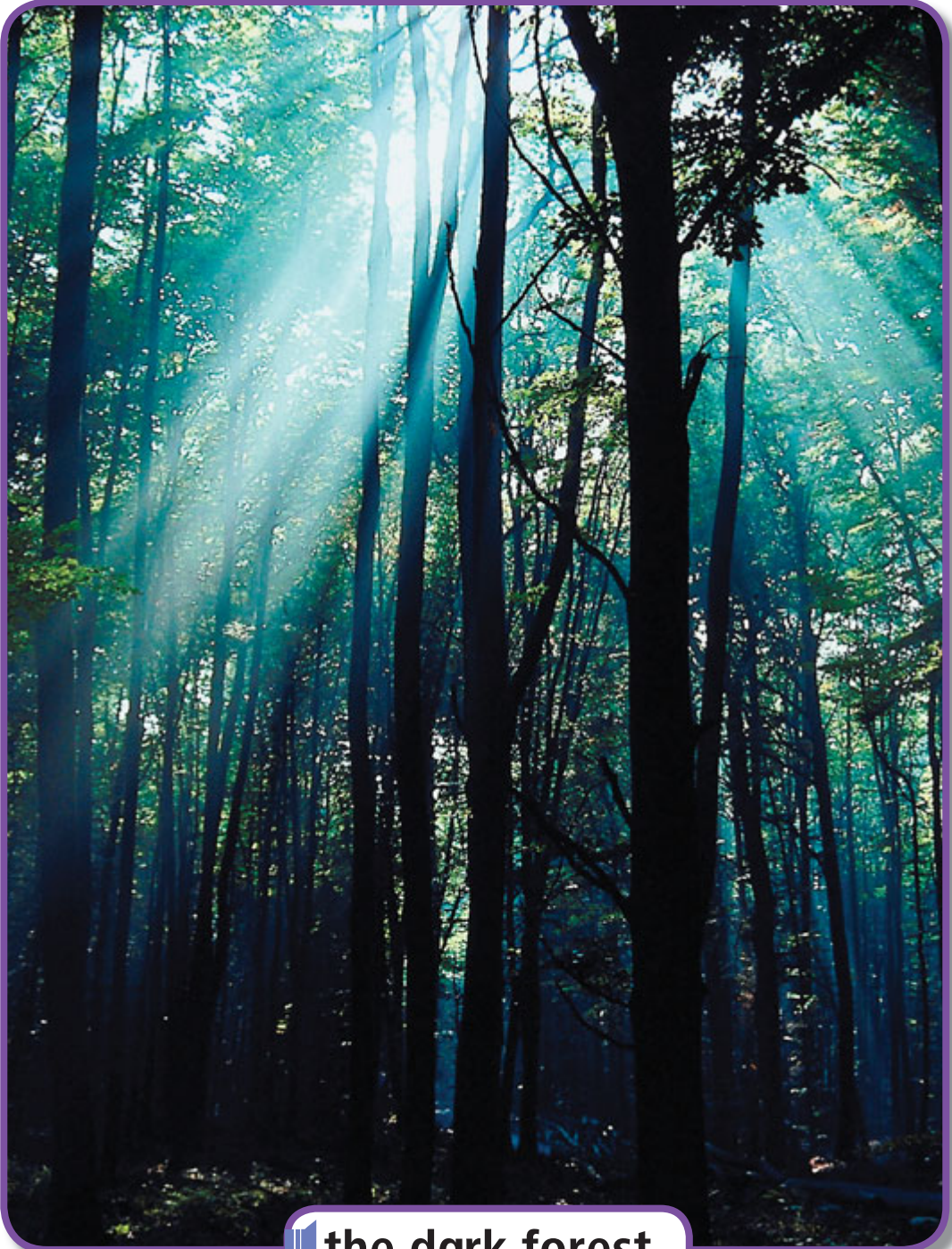
the dark forest