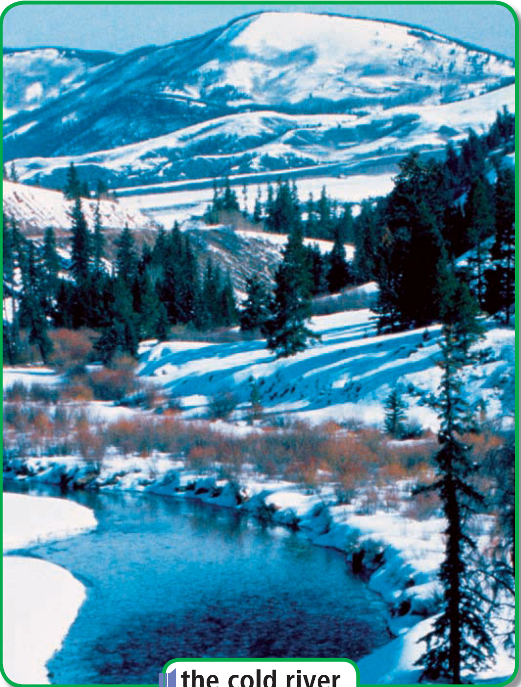
the cold river