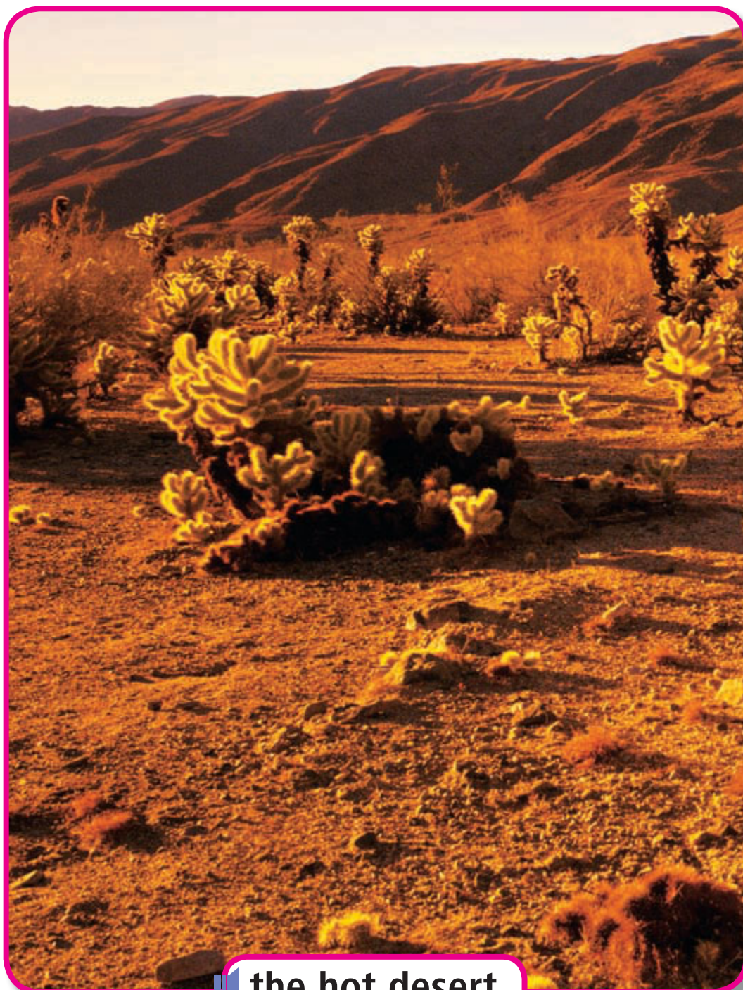
the hot desert